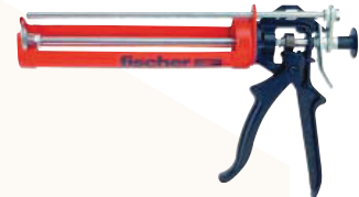
Dispenser FIS AM