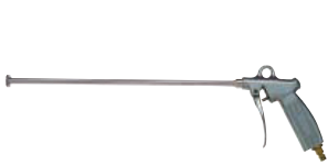
Compressed-air cleaning tool ABP