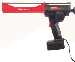
Cordless dispenser FIS DC S