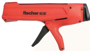
Dispenser FIS DM S