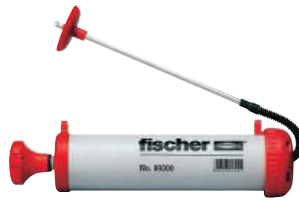
Blow-out pump ABG